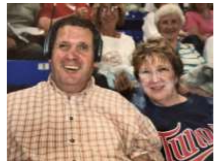
Lutheran Night at the Twins Memory